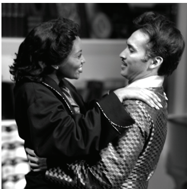
Noel Coward's Present Laughter

The rigorous training includes work in a range of types and styles of performance, including non-realistic, realistic, classical and contemporary plays. The program is intense and demanding, with actors working from 9-5, Monday-Friday, with an additional 25 hours per week spent in rehearsals. The overall aim of the program is to provide students with the practical skills necessary to fully reveal their artistic ideas. The PATP is consistently ranked among the very best